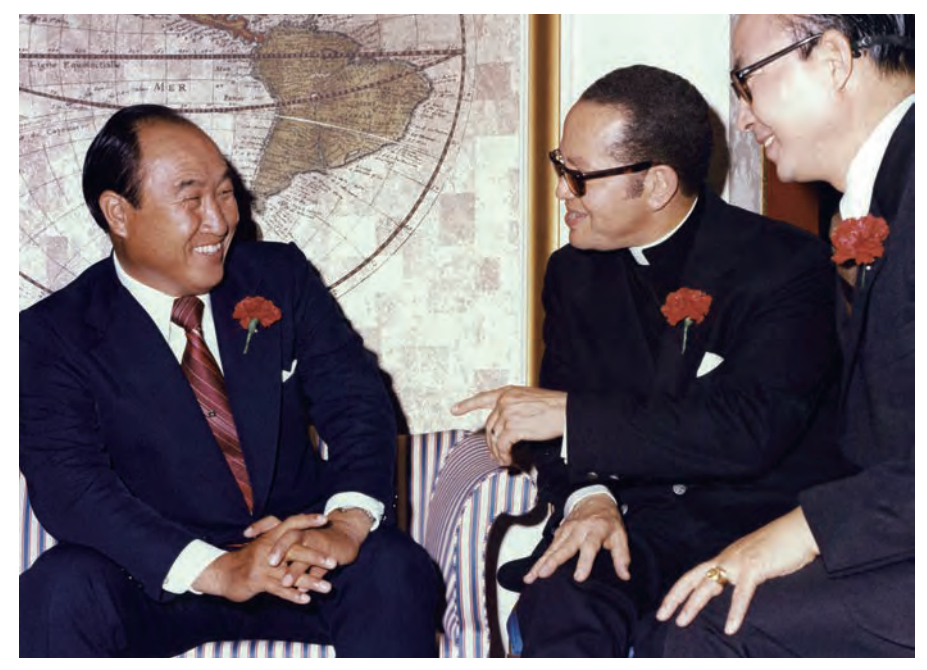
The tours generated much publicity and allowed Father to connect with public-minded figures who were working in service to their community and nation.

Our first step in becoming the true sons and daughters of God is to comprehend clearly God's view of good and evil. What is goodness and what is evil? We are not concerned with a man-made definition. God defines the eternal standard of good and evil. The sharp definition of good and evil existed at the time of his creation, long before evil ever came into being in the garden of Eden. God's view of good and evil will never change. God is eternal, his law is eternal, and his definition is eternal