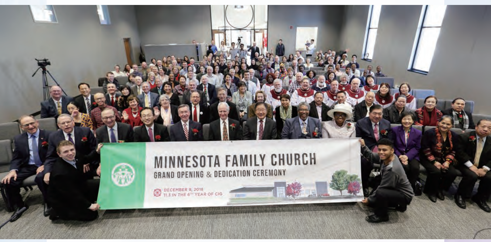
The \, Minnesota \, family \, celebrates \, its \, substantial \, success \, in \, having \, completed \, the \, first \, \, FFWPU \, church \, building \, .

Parent and True Parents for the victory of Vision 2020. Our Minnesota community brothers and sisters are so united in love and sacrifice to attend True Parents. I can see the beauty of the teamwork in our community. The ones who have talents and abilities poured everything they have into designing and constructing this building. There is no doubt that we can bring great results to fulfill our portion of responsibility by 2020. I am so happy and proud to have such a beautiful brand new church.