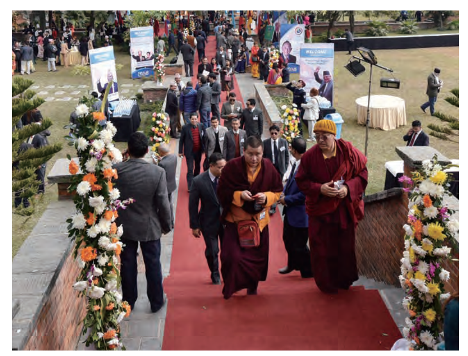
Religious, political and business leaders streaming toward the summit venue

unable to realize it. We know through history what kind of indemnity these people, who had not fulfilled their responsibilities, went through. The only daughter of God had not been found at that time.