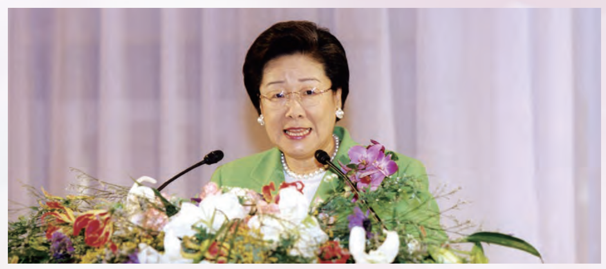
In her daily life and in recently traveling thousands of miles and pouring out her heart in the United States of America, the Republic of Zimbabwe, the Republic of South Africa and Federal Democratic Republic of Nepal, True Mother has been doing the messianic work of solving unsolvable problems.

solving on a cosmic level. True Mother is risking her position and the reputation of all the worldwide organizations she represents and founded in order to provide a much-needed answer to the critical problem of how we think of and treat women. True Mother's declaration is a game-changer.