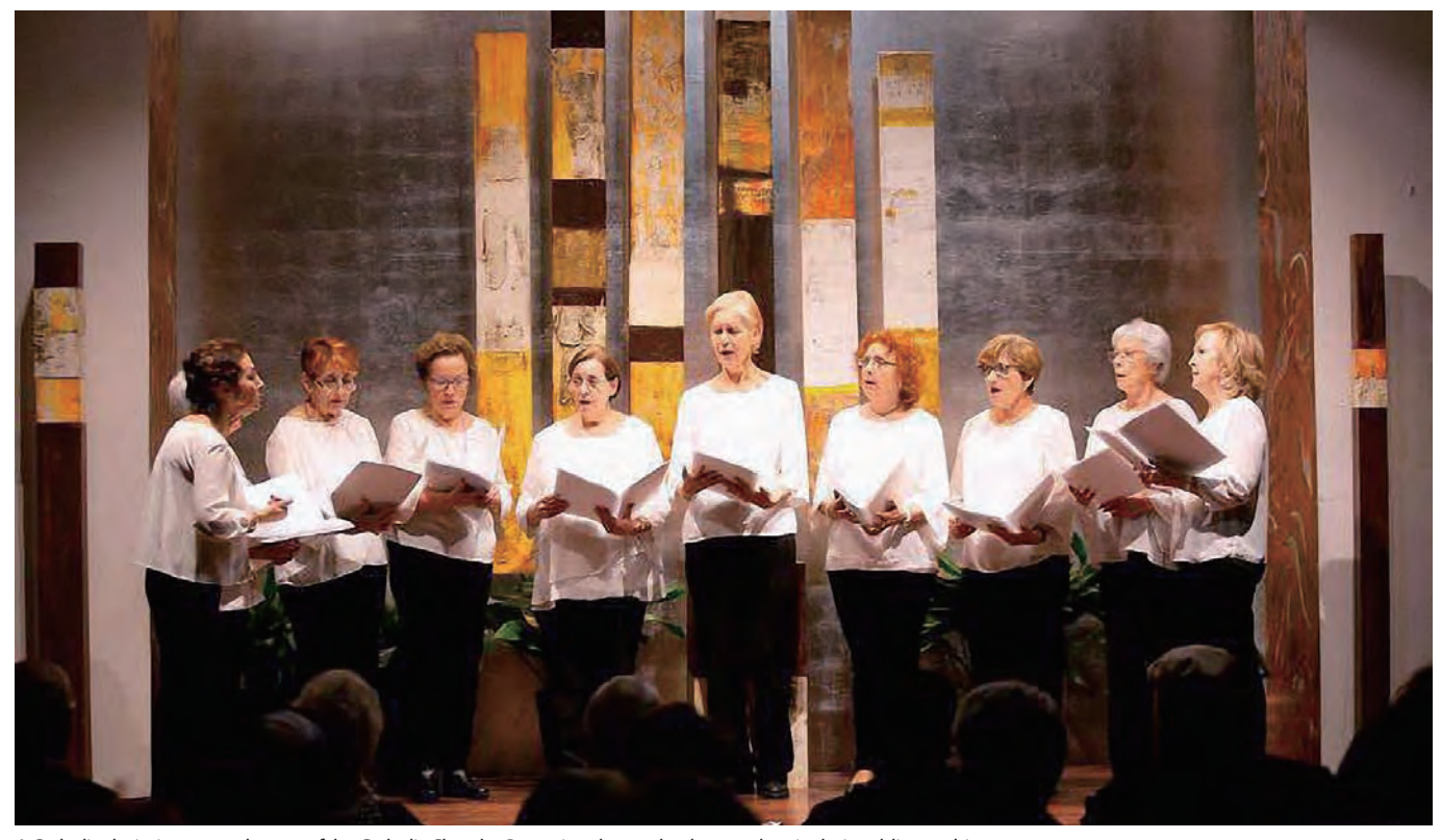
A \, Catholic \, choir \, sings \, sacred \, songs \, of \, the \, Catholic \, Church \, , \, Gregorian \, chants, \, that \, have \, a \, place \, in \, their \, public \, worship \, chants, \, the \, chants \, chants \, chants \, chants \, chants \, chants \, chants \, chants \, chants \, chants \, chants \, chants \, chants \, chants \, chants \, chants \, chants \, chants \, chants \, chants \, chants \, chants \, chants \, chants \, chants \, chants \, chants \, chants \, chants \, chants \, chants \, chants \, chants \, chants \, chants \, chants \, chants \, chants \, chants \, chants \, chants \, chants \, chants \, chants \, chants \, chants \, chants \, chants \, chants \, chants \, chants \, chants \, chants \, chants \, chants \, chants \, chants \, chants \, chants \, chants \, chants \, chants \, chants \, chants \, chants \, chants \, chants \, chants \, chants \, chants \, chants \, chants \, chants \, chants \, chants \, chants \, chants \, chants \, chants \, chants \, chants \, chants \, chants \, chants \, chants \, chants \, chants \, chants \, chants \, chants \, chants \, chants \, chants \, chants \, chants \, chants \, chants \, chants \, chants \, chants \, chants \, chants \, chants \, chants \, chants \, chants \, chants \, chants \, chants \, chants \, chants \, chants \, chants \, chants \, chants \, chants \, chants \, chants \, chants \, chants \, chants \, chants \, chants \, chants \, chants \, chants \, chants \, chants \, chants \, chants \, chants \, chants \, chants \, chants \, chants \, chants \, chants \, chants \, chants \, chants \, chants \, chants \, chants \, chants \, chants \, chants \, chants \, chants \, chants \, chants \, chants \, chants \, chants \, chants \, chants \, chants \, chants \, chants \, chants \, chants \, chants \, chants \, chants \, chants \, chants \, chants \, chants \, chants \, chants \, chants \, chants \, chants \, chants \, chants \, chants \, chants \, chants \, chants \, chants \, chants \, chants \, chants \, chants \, chants \, chants \, chants \, chants \, chants \, chants \, chants \, chants \, chants \, chants \, chants \, chants \, chants \, chants \, chants \, chants \, chants \, chants \, chants \, chants \, chants \, chants \, chants \, chants \, ch

n Tuesday evening, December 18, our interfaith family in Madrid gathered together to ask God for his blessings on the new year and to show the beauty of spiritual diversity through music, words and food. We decorated the stage simulating an altar. Our desire was to help the very diverse attendance group to have a deep experience through the setting itself