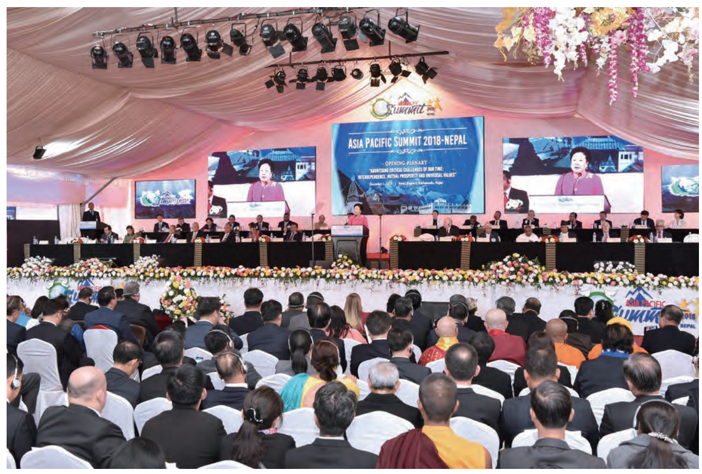
This is a photograph of True Mother giving this speech to the delegates in the Hyatt Hotel in Kathmandu

ear distinguished leaders, ambassadors for peace and ladies and gentlemen that are participating in this Asia Pacific Summit: Today we have gathered here with the desire to answer the question of how we can realize an eternal world of freedom, equality and peace, which has been a desire of humankind for so long. Conflicts between races, religions and ideologies, territorial disputes, war and tribal conflicts have kept the world from becoming a peaceful one, even for a day. Moreover, due to human ignorance this beautiful world is becoming sick. When we look at this, what must we do?