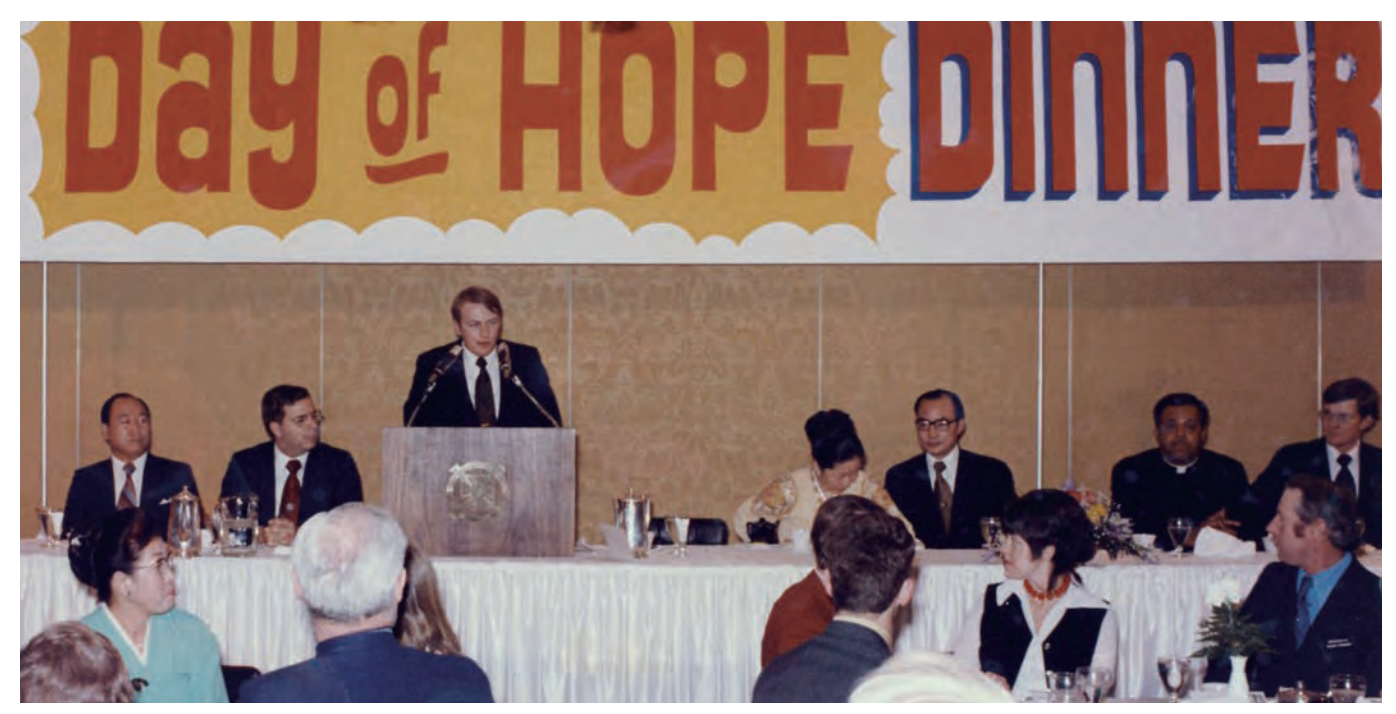
This picture was taken during a speaking tour in the city of Des Moines in the US State of Iowa. True Parents went on numerous speech tours of the United States in the 1970s in order to revive the nation and awaken the American people to God's will in the modern day.

et me make another analogy. Let's say there is a most handsome man and a most beautiful woman. They are not only attractive, but also all-powerful and all wise. You would be anxious to have some kind of personal relationship with this great man and woman. What would you want it to be?