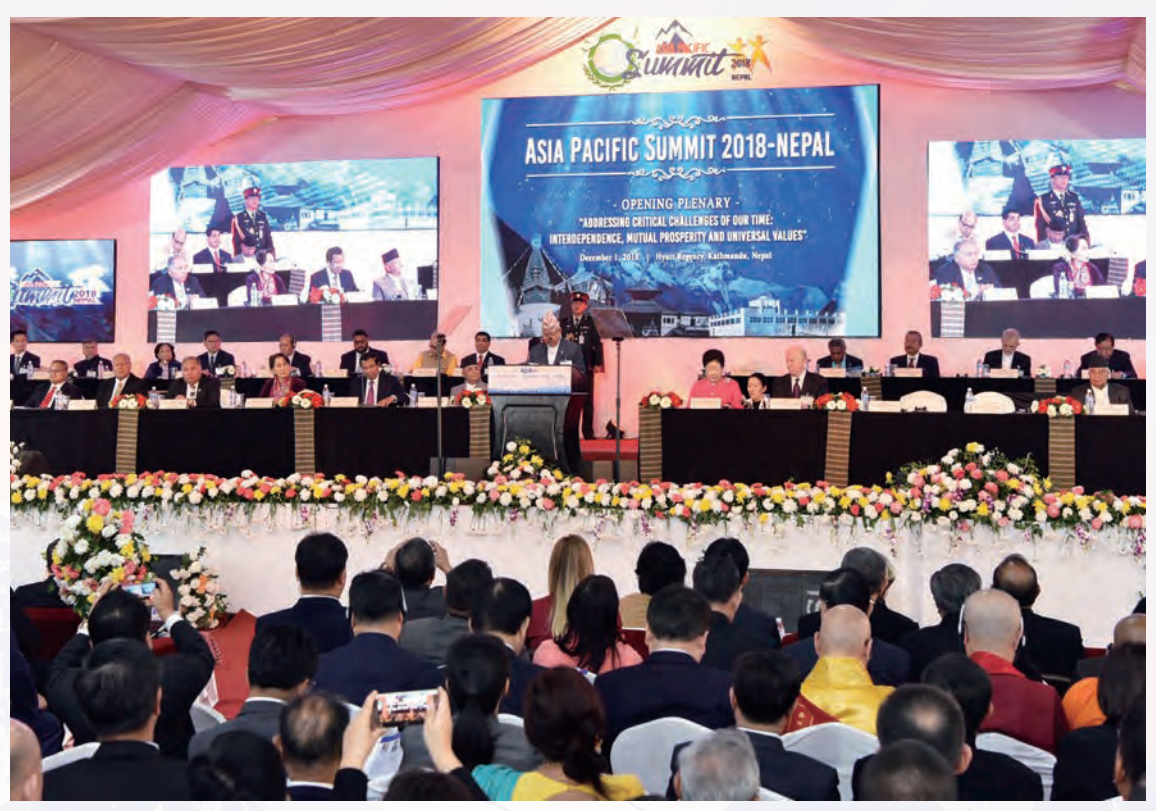
What transpired in Nepal was indeed a summit, with the highest-level officials from various nations in attendance. The speaker is here is chairman of the organizing committee and an ex-prime minister of Nepal, Madhav Kumar Nepal.

agenda of UPF as supporting tourism and the government's Visit Nepal Year 2020 campaign; we were encouraged to highlight particularly Lumbini, the birthplace of Lord Buddha, as an international tourist destination. During the summit, bilateral and multilateral meetings took place. Dialogue and discussions were planned that would explore new diplomatic opportunities for Nepal.