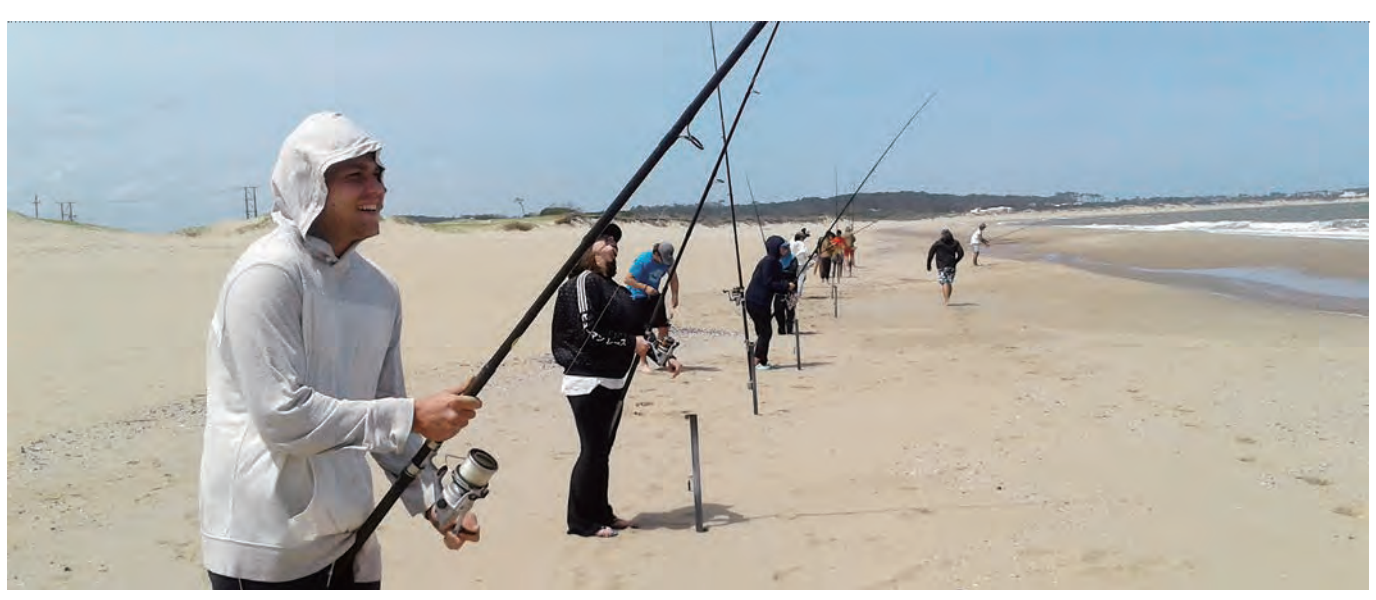
Uruguayan members carrying on a tradition True Father himself set, an annual fishing condition carried out under specific conditions

n 1996, True Father was inspired to establish a condition of devotion at José Ignacio beach, located on the southeast coast of Uruguay. The activity started on December 1 of the same year and since then we have called it the Condición de Pesca de la Corvina Negra (The Black Corvina Fishing Condition).